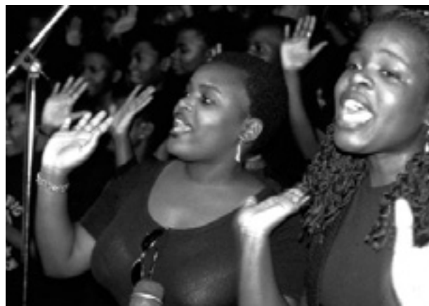
UGANDA: Kampala Pentecostal worship

The other difference between the two styles of worship is the use of contemporary musical instruments.