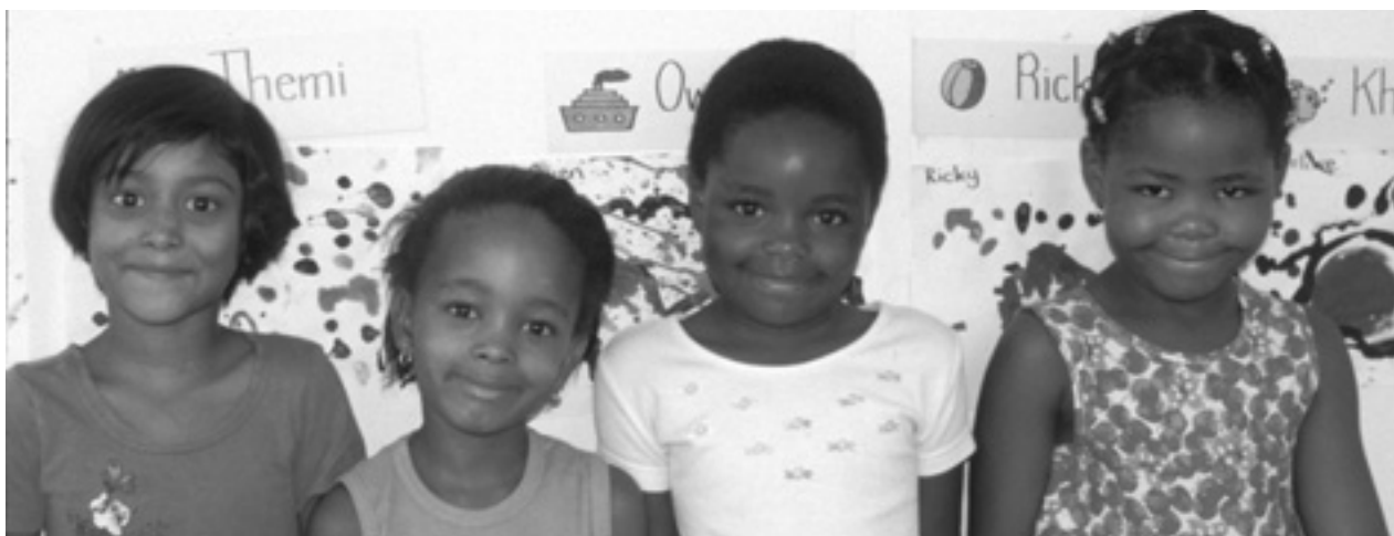
SOUTH AFRICA: Highway Nursery School