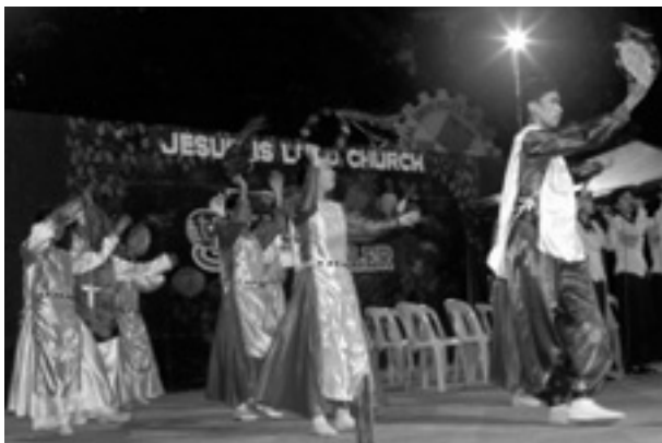
PHILLIPINES: Jesus is Lord Church, Manila

For one thing, it is unfair for Protestants in North America to superimpose stereotypical images of televangelists on Christians in the developing world and then marginalize them as unsophisticated, culturally retrograde animists who are engaged in superstitious behaviors that compensate for their deprived social circumstances. It is quite possible that God acts in miraculous ways on behalf of people who have no recourse to antibiotics and modern medicine. In addition, it is also possible that many people who involve their body as well as mind in worship may have escaped certain limitations of the modernist worldview. Indeed, they may actually be more holistic in their mentality than Western Christians who are trapped in an Enlightenment worldview. Finally, many of these Christians may have a better under-