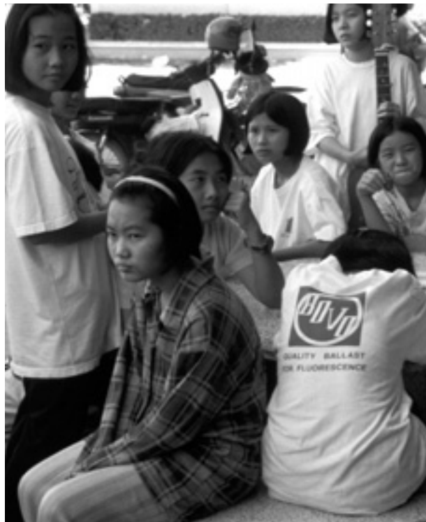
THAILAND: Hope of Bangkok Home for Girls

Another way of describing these differences is that new paradigm leadership is based on relationships in the congregation, not functional positionality within a denomination's career structure. Such relationships are