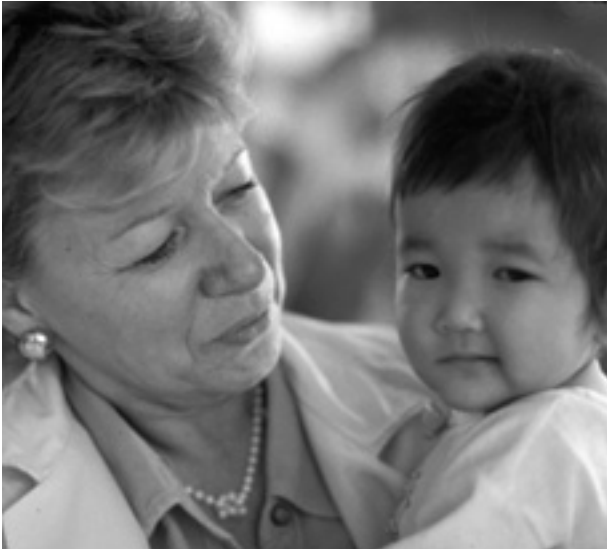
THAILAND: Bangkok Baby Home