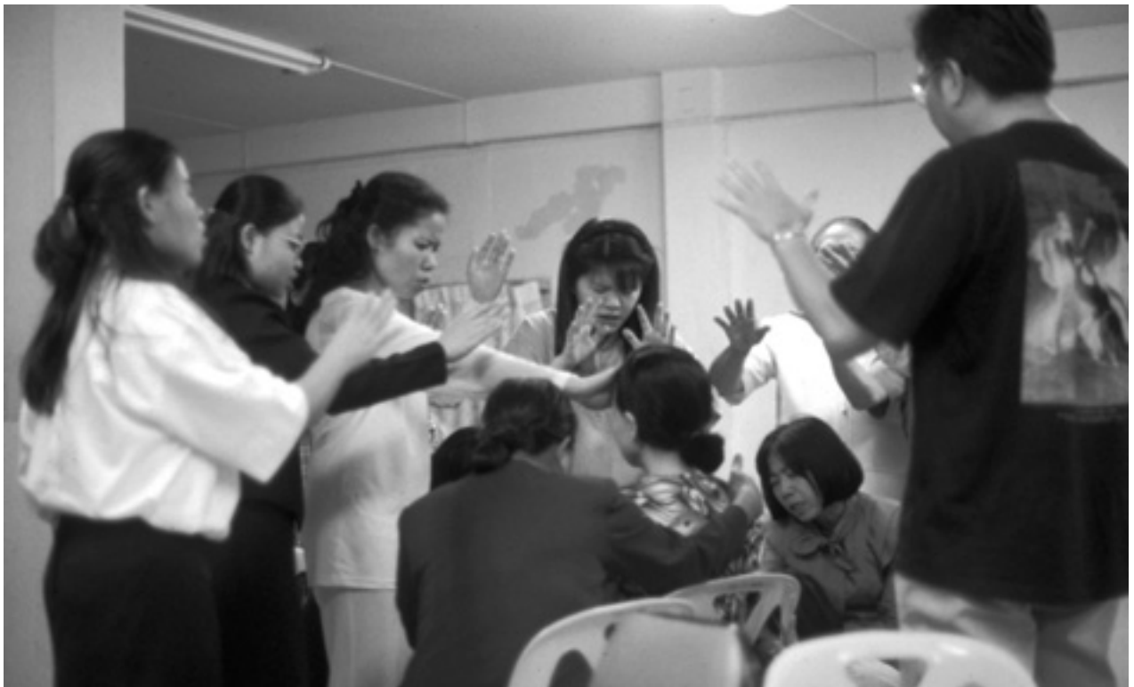
THAILAND: Bangkok worship service

Christianity, as had been true in the past, is changing, and as it changes, the patterns of education that will be needed for religious leaders will change. As these patterns change, old schools will adapt to new patterns of education and other, new schools will be founded to embody them.