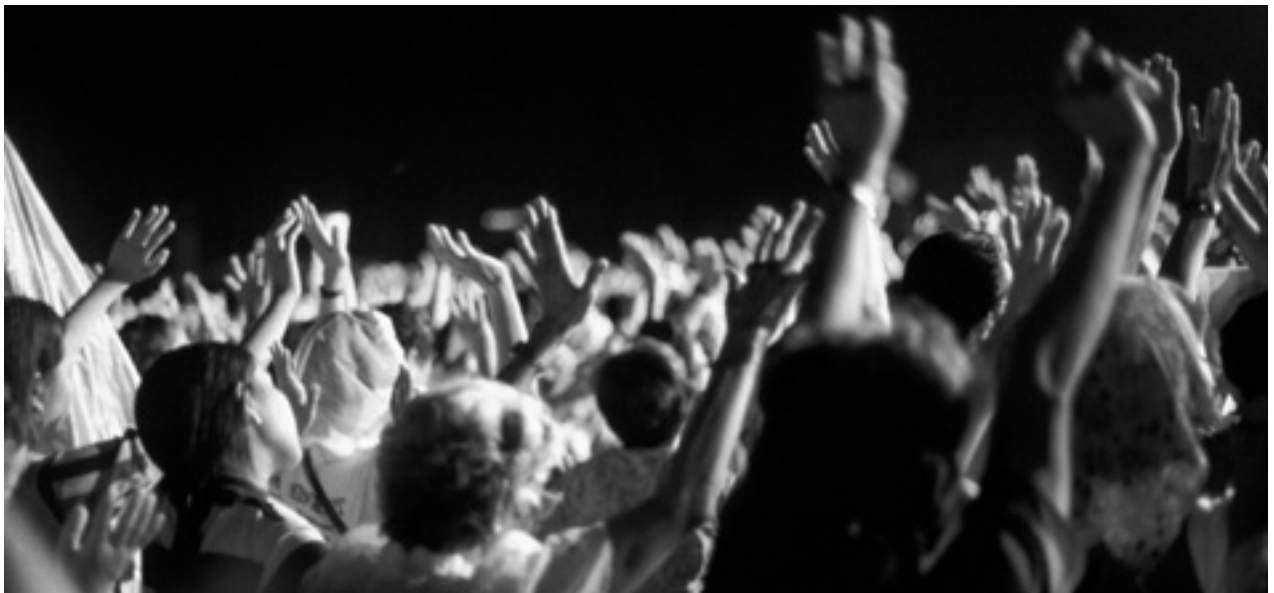
PHILLIPINES: El Shaddai , charismatic Catholic sect, Manila

Within my own Anglican tradition, there has been a strong emphasis on the “trinity” of tradition, reason, and scripture as a means for knowing God’s will. This formula dates back to the late 16th and early 17th centuries where first John Jewel and then Richard Hooker used the formula to do battle with both Catholics, who ignored scripture, and Protestants,