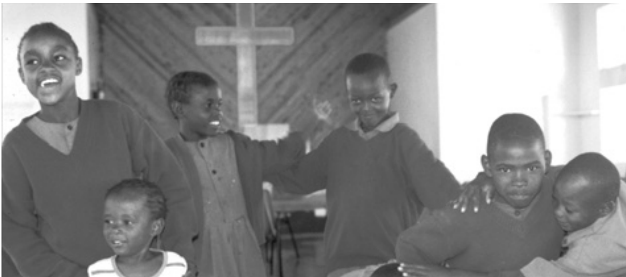
KENYA: Nairobi Pentecostal Church

Much of their training of new leaders starts in a cell group of eight to 10 people, said Oscar. When the group grows to approximately 12, it is time for the cell to divide. When the split occurs, the apprentice to the