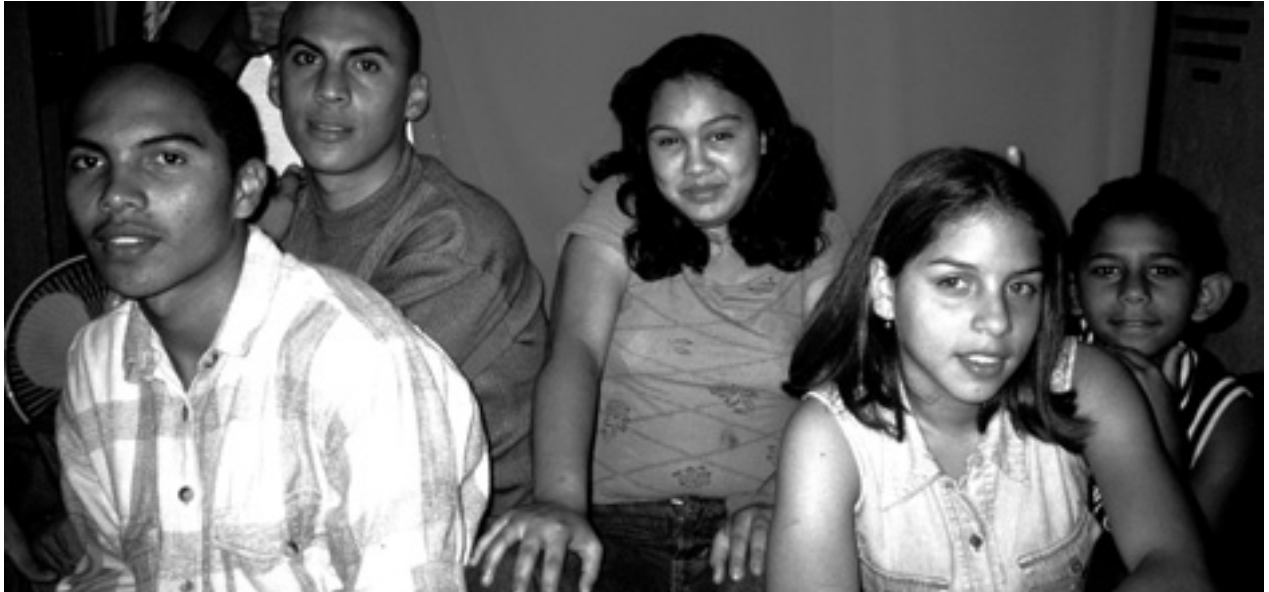
VENEZUELA: Church youth, Caracas

My third recommendation has to do with the various means by which Christians around the world are attempting to manifest God's love in the face of global poverty, the AIDS pandemic, and a hundred other needs associated with the human inclination toward greed and violence. Personally, I feel very privileged to have had the opportunity to travel extensively, witnessing many different efforts by Christians around the world to be God's agents of healing, reconciliation, and justice. In this process, I have been struck by how creative and entrepreneurial Christians in the developing world are in addressing intractable social problems, but, unfortunately, many of these programs exist in isolation.