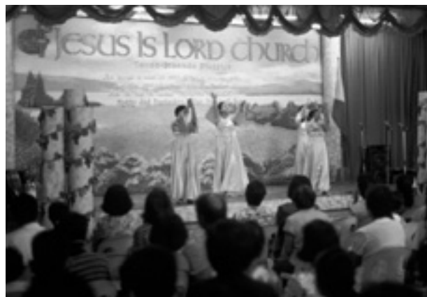
PHILIPPINES: Jesus is Lord Church, Manila