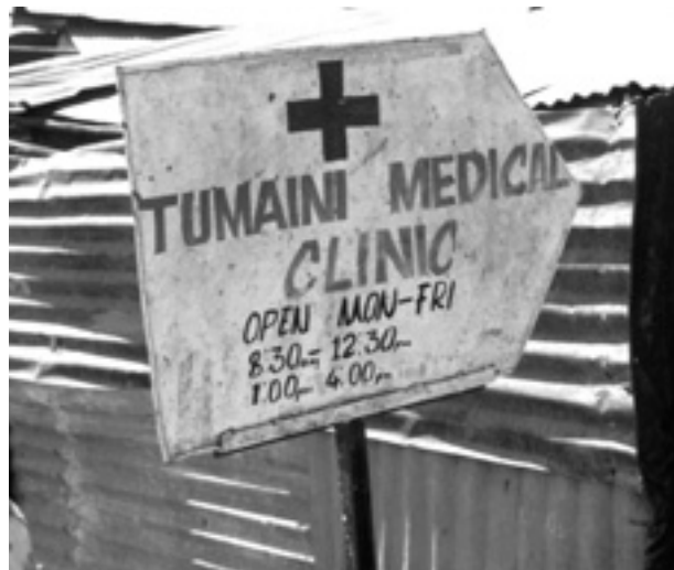
KENYA: Nairobi Chapel clinic

In the last decade or so, many Pentecostal and charismatic churches around the globe seem to be increasingly catching a vision of addressing the social needs of their communities. Historically, these churches tended to focus on the spiritual needs of potential converts. More recently, however, they have been reading their Bibles through a different lens. Renacer Church in Sao Paulo, for example, sends out