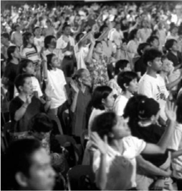
PHILLIPINES: Jesus is Lord Church

not so much by inventing fresh trends as by amplifying or sharpening ones already present.